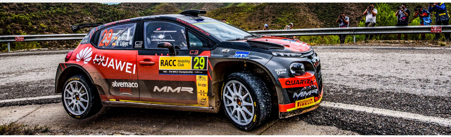
*Non contractual document, technical data may change.

Length : 3,996 mm Width : 1,820 mm Wheel base : 2,567 mm Track : 1,618 mm (front and rear) Fuel tank : 81 liters Weight : 1,230 kg minimum (regulated) / 1,390 kg with driver and co-driver (regulated)